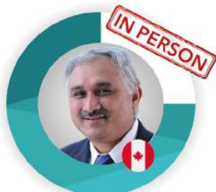
Prof. Parameswaran Nair

ETS 2022 ANNUAL CONGRESS MAY 27 | 28 InterContinental Dubai Festival City